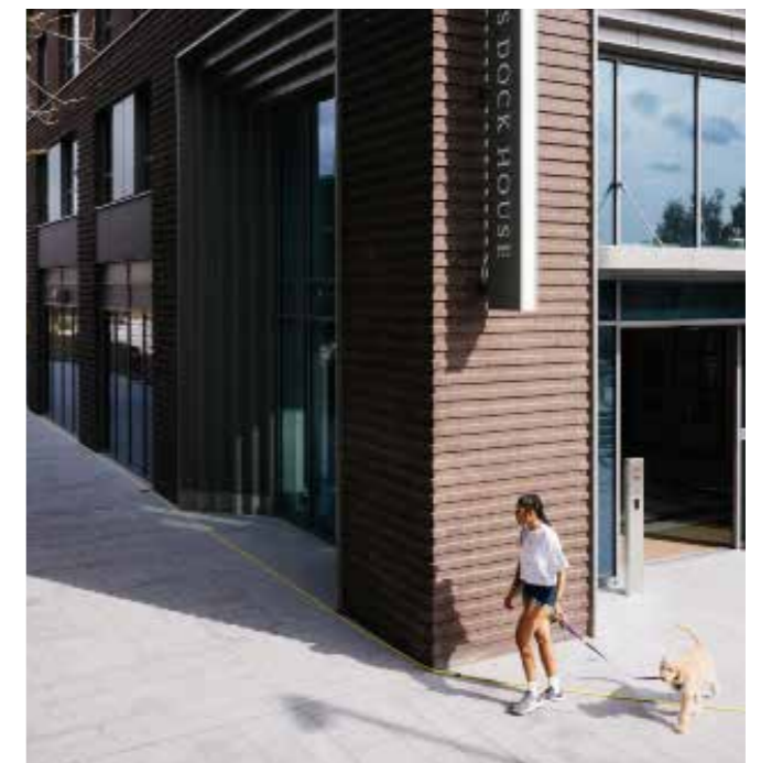
HAM WHARF STREET FRONTAGE