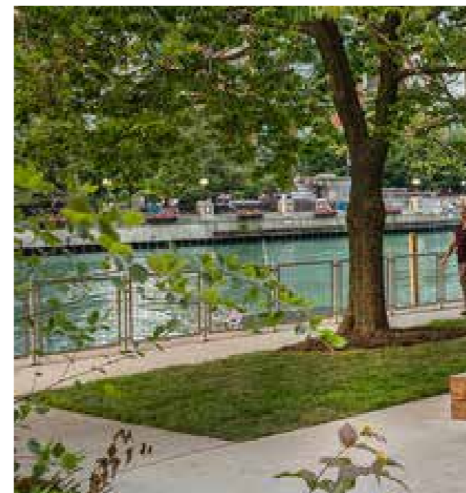
CANAL SIDE WALKWAY