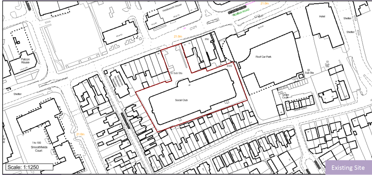
Future site allocation