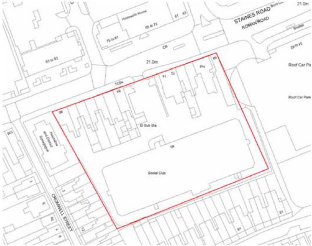
Current site allocation