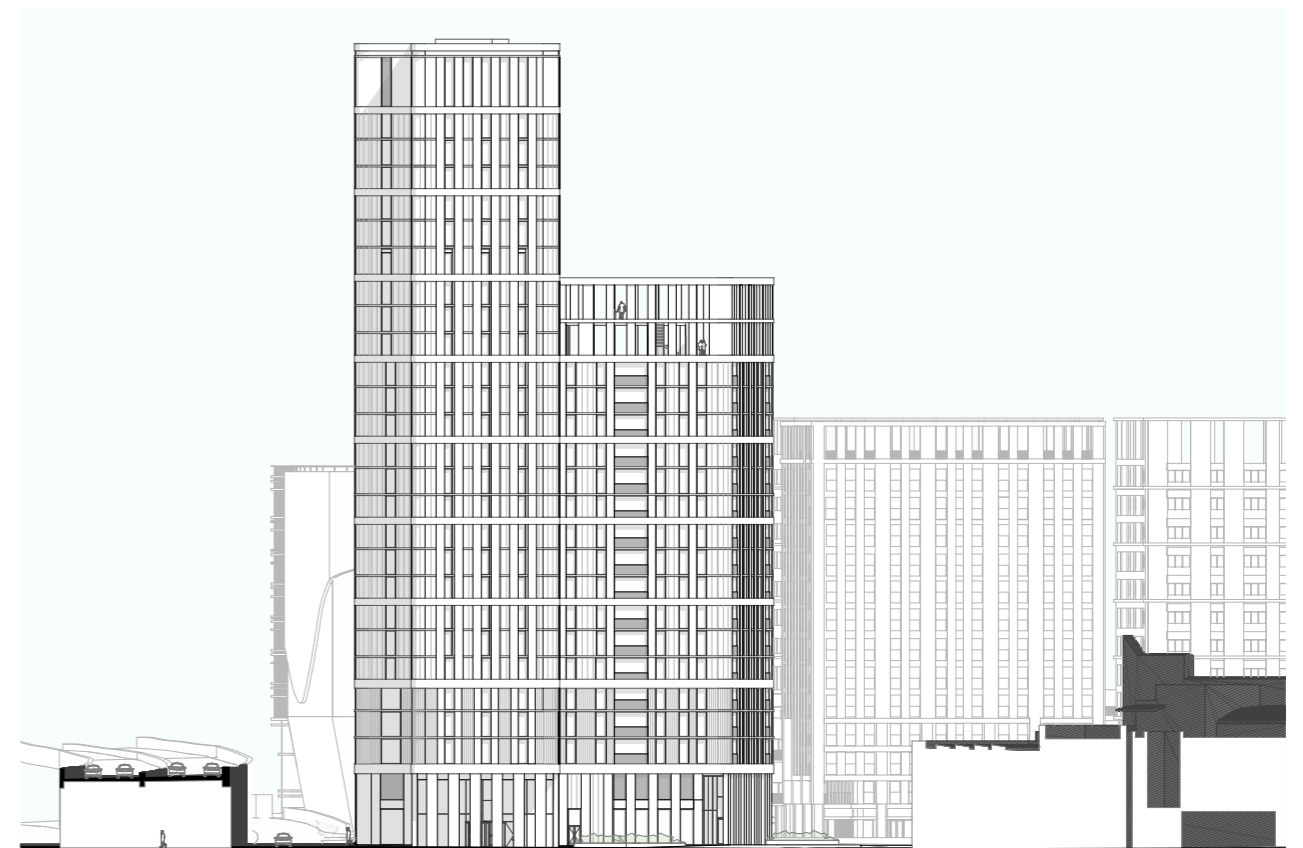
SOUTH EAST ELEVATION E3

Narrower bedroom window type (~1.1m). Deepest window reveals (300mm) Horizontal shading created by banding on all stories. Brise soleil shading to the double height co-living amenity at the lower floors. Increased vertical shading by white bands variant.