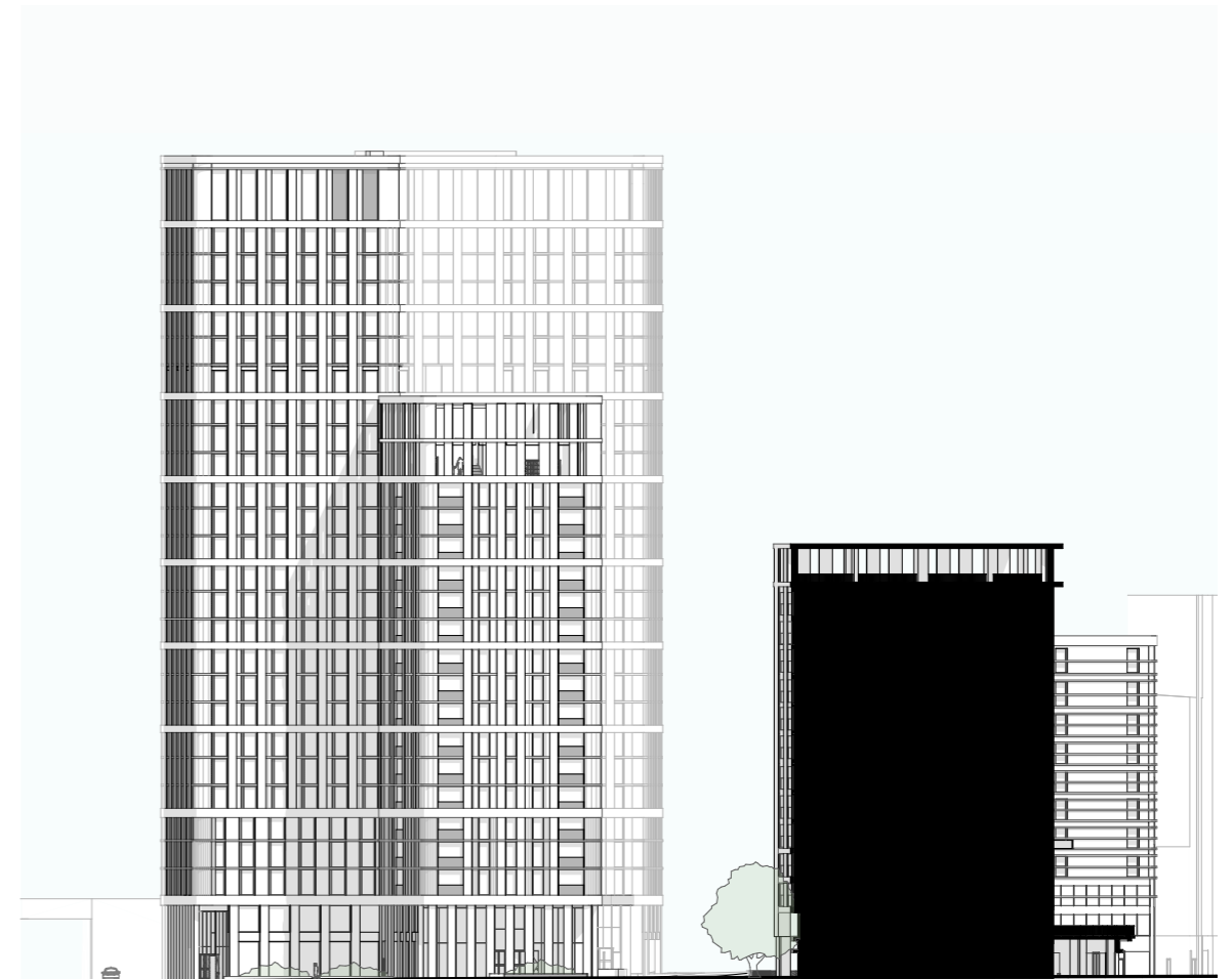
NORTH EAST ELEVATION E4

Wider bedroom window type (~1.55m). Shallower window reveals (150mm). White verticals increase vertical shading.